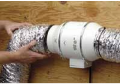
Connect ducts to fan housing